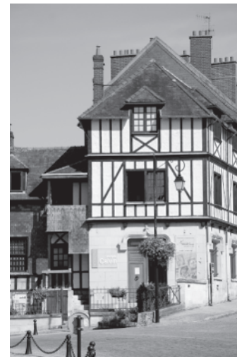
The family home of John Calvin in Noyon