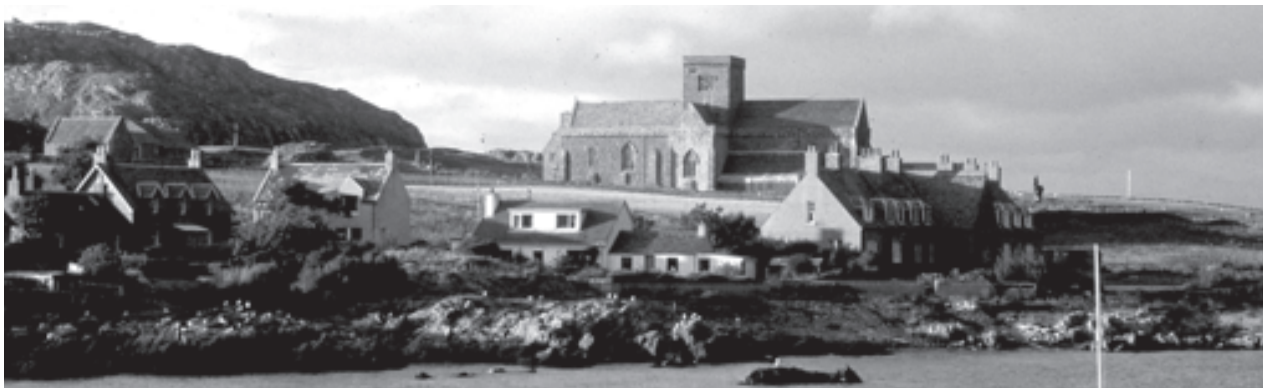
Isle of Iona